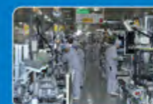
机械加工领域 Mechanical Manufacturing Field