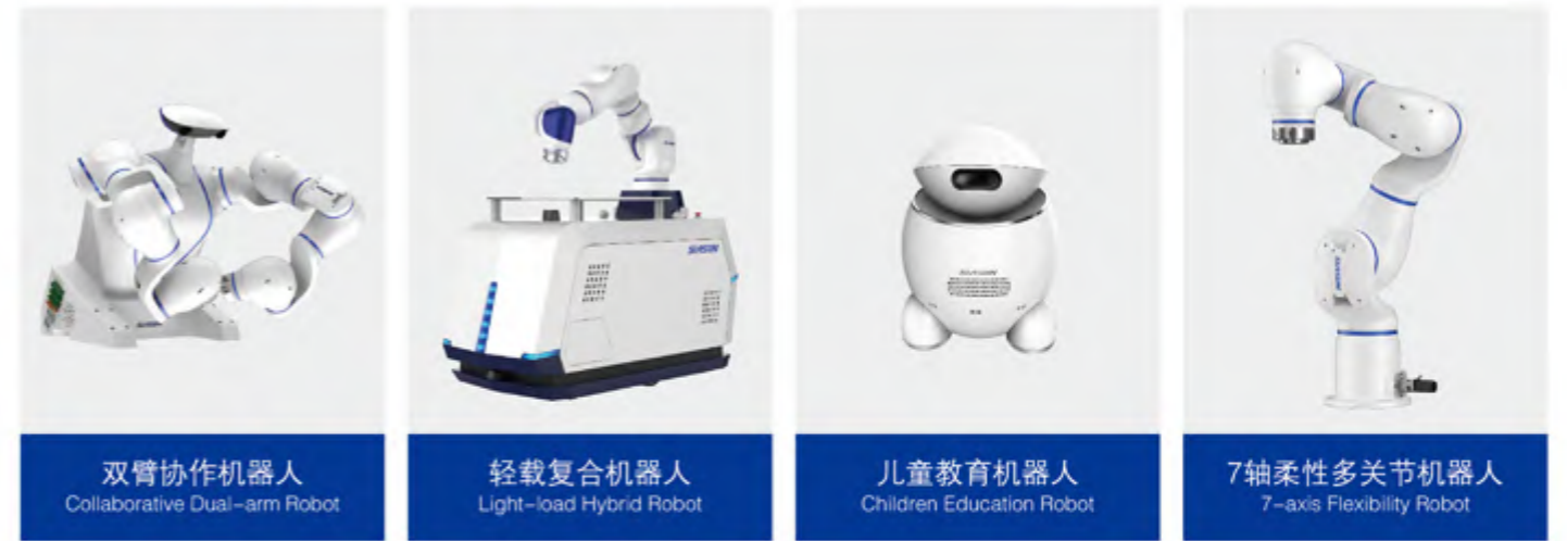
双臂协作机器人 Collaborative Dual-arm Robot

开启人机协作新时代 Creates a New Era of Human-machine Corporation