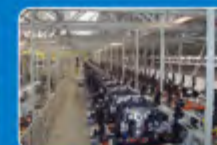
汽车制造领域 Automobile Manufacturing Field