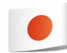
亚太区日本研发中心 Asia-pacific Japan R&D Center