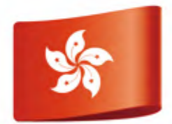
亚太区香港服务中心 Asia-pacific HongKong Service Center