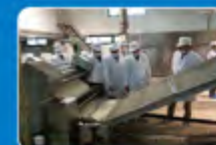
食品加工领域 Food Processing Field