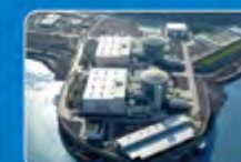
核工业领域 Nuclear Industry Field