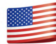
北美区美国研发中心 North America U.S. R&D Center