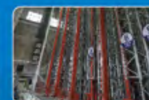
医药产品生产领域 Pharmaceutical Products Production Field