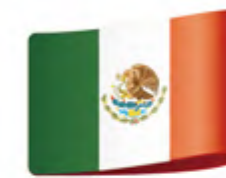
北美区墨西哥服务中心 North America Mexico Service Center