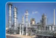
石油化工领域 Petrochemical Industry Field