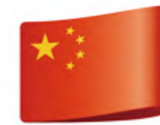
中国区研发中心 Asia-pacific China R&D Center