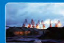
煤炭领域 Coal Field

Robot technology as the core. Based on independent innovation technology and products Provide strong support for enterprises' intelligent transformation and the most professional & suitable Industrial 4.0 total solution