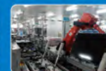
电子电器领域 Electronic Field