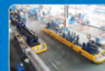
工程机械领域 Engineering Machinery Field