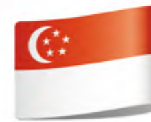
亚太区新加坡服务中心 Asia-pacific Singapore Service Center